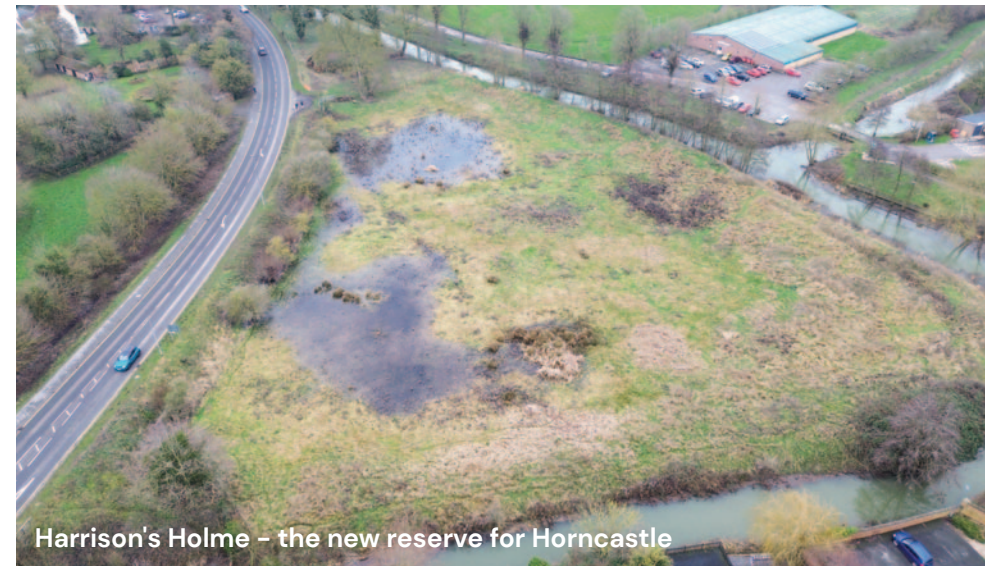
Harrison's Holme – the new reserve for Horncastle

As well as the wildlife, Banovallum House shows how the Trust looks for opportunities to make more space for wildlife and work in partnership to achieve more. From the initial purchase in 1993, Banovallum House