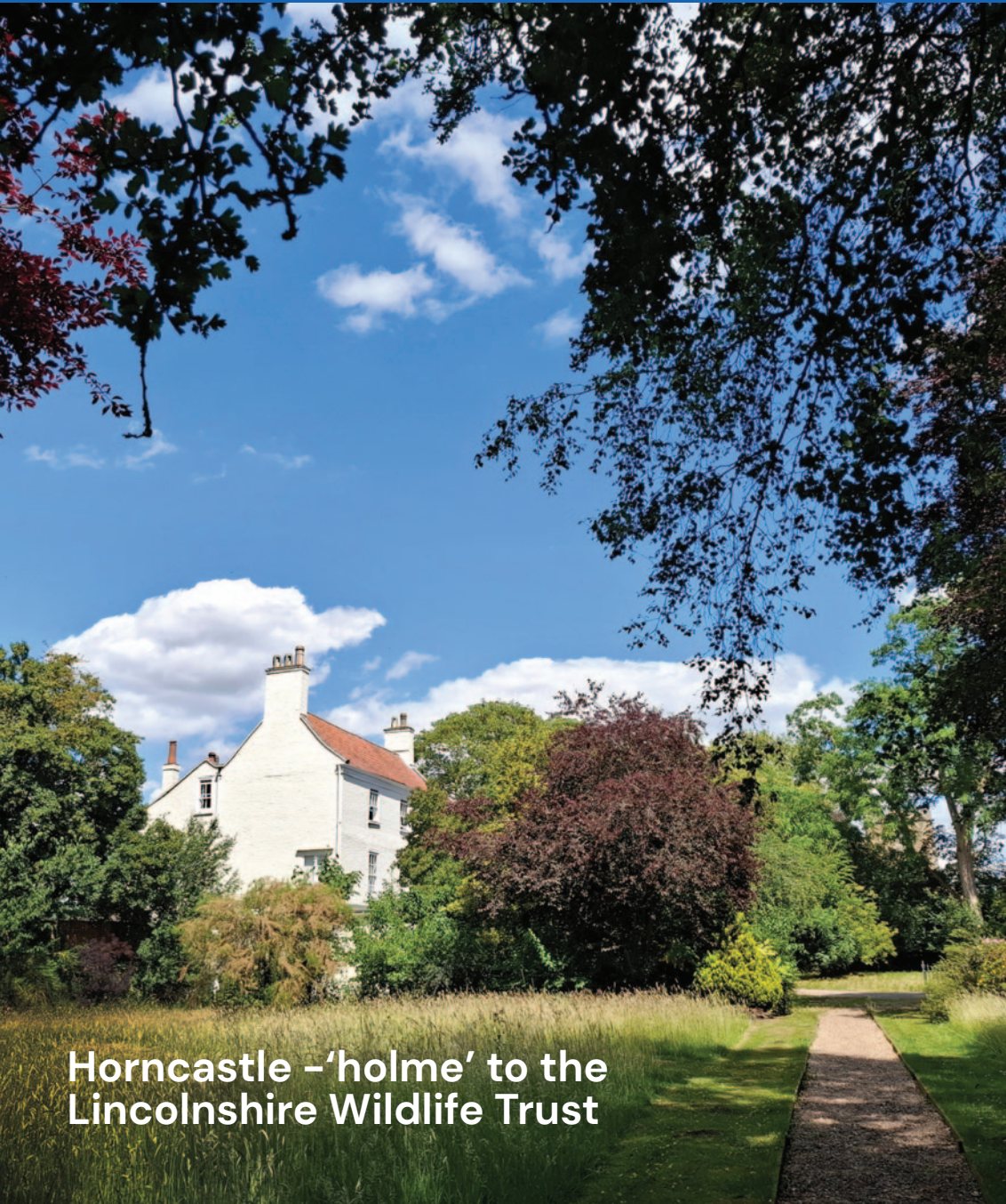
Horncastle – ‘holme’ to the Lincolnshire Wildlife Trust