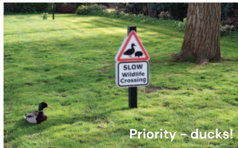
Priority – ducks!

By the start of the 1990s, the Trust had outgrown its accommodation in the Manor House in Alford; its home since 1965. The location of Banovallum House was ideal, reasonably central in the county and