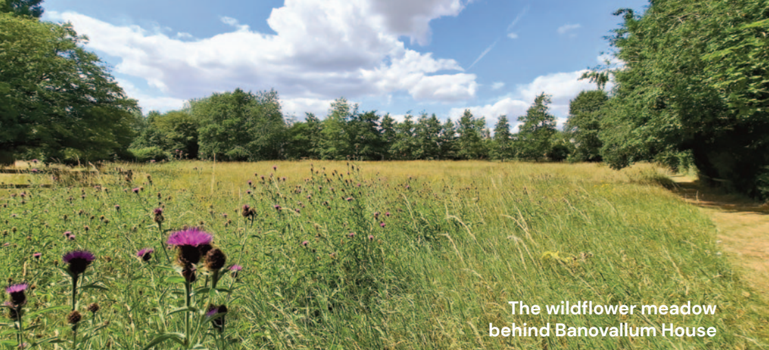
The wildflower meadow behind Banovallum House